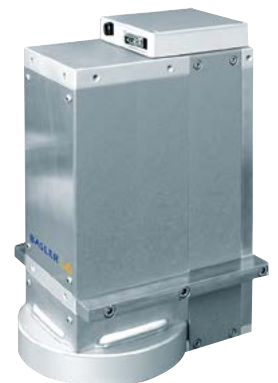
Example of an image processing system: Basler L6 System for controlling of printed images for CD/DVD labels

The requirements for an industrial image processing camera vary from application to application, but are in all cases markedly different from those you might be familiar with from your own consumer-grade digital camera. The key requirements for example are related to sensitivity, dynamic range, noise level, frame rate and resolution.