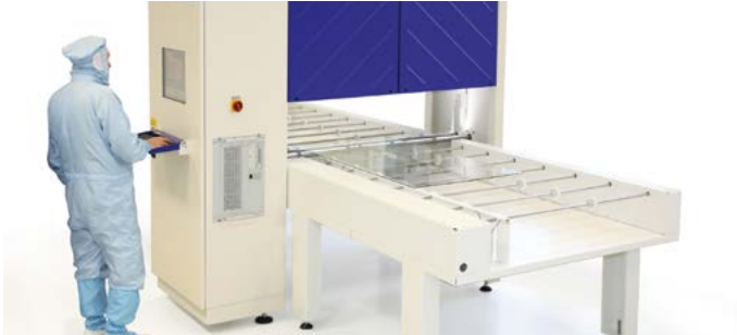
Example of an image processing system: Equipment for inspection of glass substrates for thin film solar industry

Image processing systems handle tasks like measuring and counting vehicles or products, calculating their weight or volume, sorting goods at high speeds based on pre-defined characteristics and automatically extracting small but decisive pieces of information from giant volumes of data. They help experts interpret images by filtering, optimizing, supplementing and making them available for quick retrieval. They are tireless and give consistent effort.