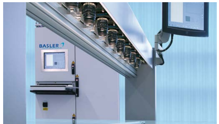
Basler system for inspection of plastic sheets