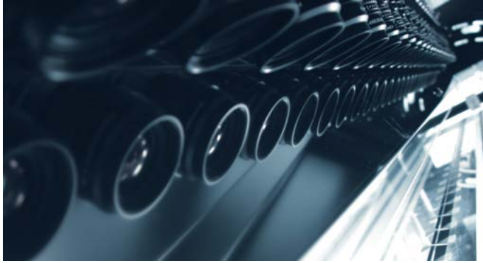
Camera bar on an image processing system (Basler system for inspection of glass substrate for TFT displays)

Yet what exactly is involved with these inspection tasks? Let's take a look at the requirements definition.