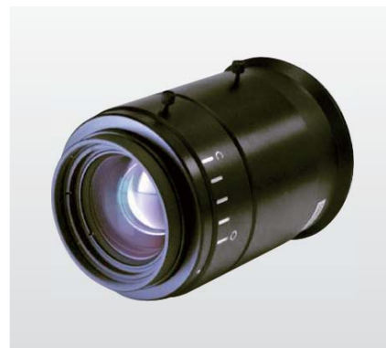
Line Scan Lens for 62mm Sensor

The lens comes standard with a M72-FB31.8mm camera mount and optional mounting adapters such as M72-6.56/19.55 & TFL2 are available. Mounts for large format area scan cameras can also be provided.